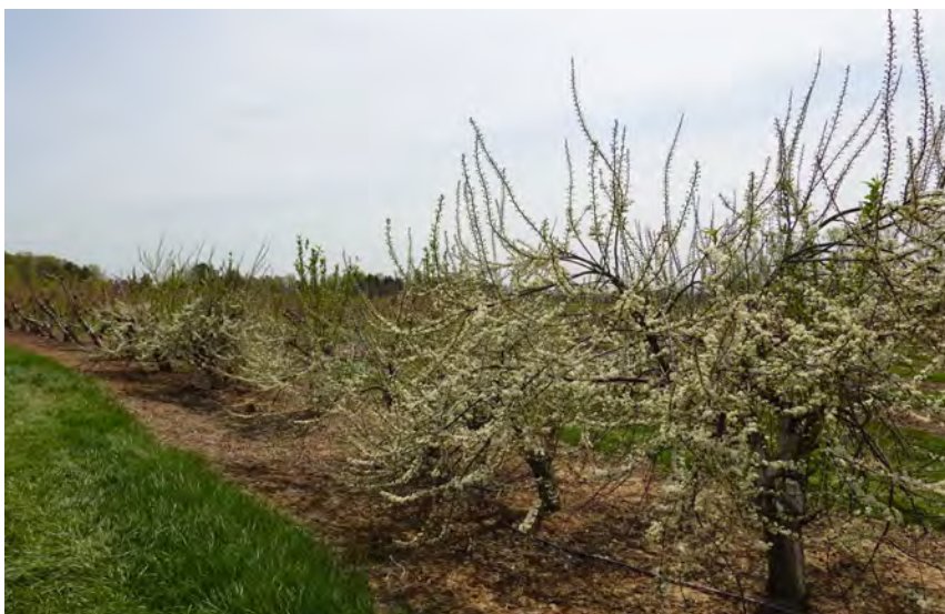
Rutgers Beach Plum, bp1-1, grafted onto a peach tree at the Snyder Farm, Rutgers