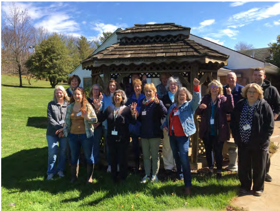
The Master Gardeners

61 unique horticultural questions answered and problems solved for County residents on Helpline.