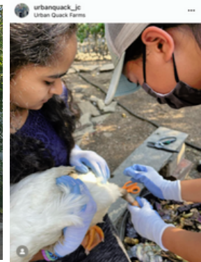
Photo (left): Youth at Guttenberg Arts with certificates; (center) Youth presenting their final projects; (right) Youth at Urban Quack.

We had another successful year of Youth Urban Farm Club, in which over 65 youth ages 10-18 learned about gardening, composting, animal husbandry, urban agriculture, herbalism, and art. Our youth supported with beautifying their community, maintaining gardens and compost operations, creating art projects centered on plants, crops, and agriculture, learning to take care of farm animals in an urban setting, and meeting new friends! They also gained volunteer community service hours for their participation. Our exceptional adult volunteers from eight different sites provided a fun and supportive settings for our youth to enjoy a great summer outdoors.