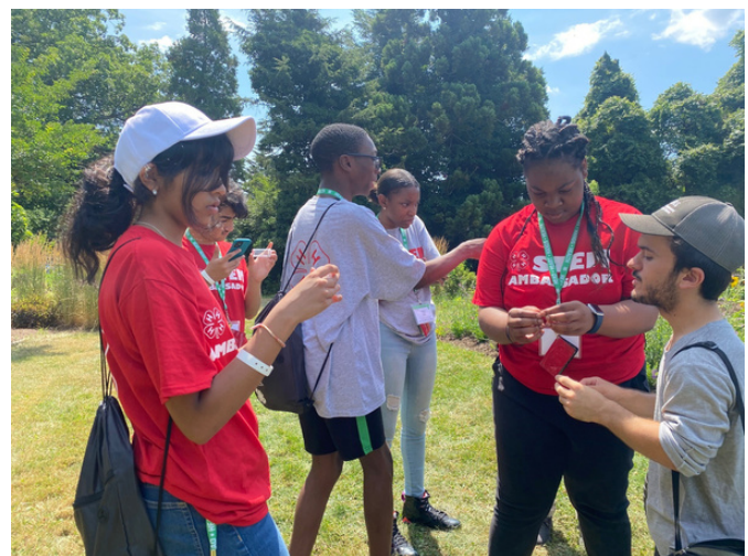
Photo of 4-H STEM Ambassadors at Rutgers Gardens learning about bees.

After almost two years of virtual programming, 4-H STEM Ambassadors relaunched in person once again at our Rutgers New Brunswick campus in July, where 12 Hudson County youth engaged in learning from Rutgers scientists and engineers, participated in research projects, gained leadership skills, and obtained college readiness skills. Youth spent close to a week on campus exploring STEM, team building, visiting the various campuses, and much more. Youth were trained in various STEM activities and challenges, which they will teach to younger youth as part of their yearlong participation in the 4-H STEM Ambassador program.