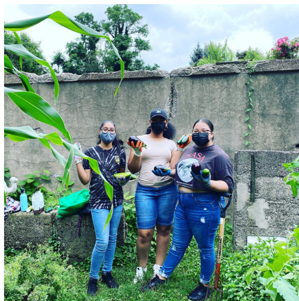
Photo of youth with their harvest taken at Harsimus Cemetery.

One of our flagship programs, Youth Urban Farm Club, is returning this summer! This program connects Hudson County youth ages 12-18 with community garden and small urban farm sites led by adult volunteers from the community. Youth learn skills in horticulture, urban agriculture, and animal husbandry. Youth gain hands-on experience while also learning about food systems, the local environment, art, and more. We are thrilled to be partnering with eight amazing community gardens and urban farms, including: Urban Quack , Brunswick Community Garden , Historic Jersey City & Harsimus Cemetery , Sgt. Anthony Park & Garden , Guttenberg Arts , James J. Braddock Community Garden, Xchange Community Garden, and the 4-H Family Learning Garden. For more information or to complete an application for the wait list, please visit: our IC or our website HERE