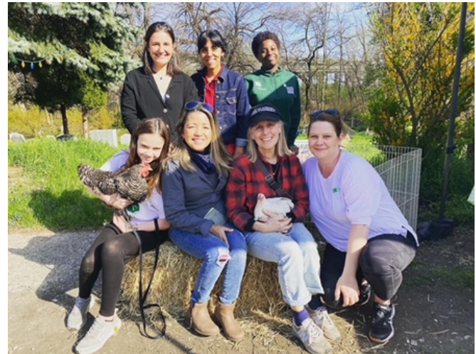
Photo of some of our 4-H Advisory Board members and youth.

Visit our website: https://hudson.njaes.rutgers.edu/4h/