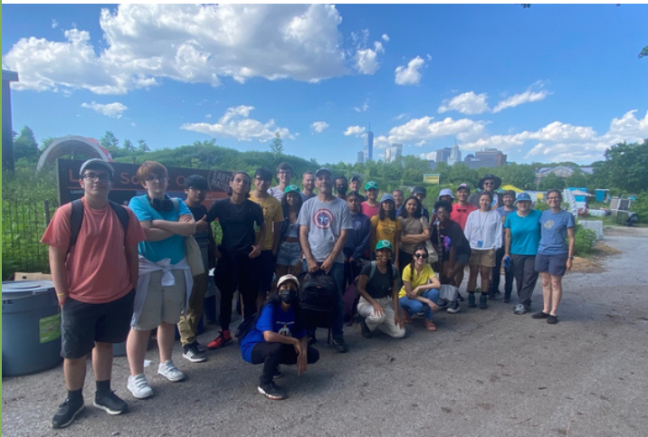
Photo of our visit to Earth Matter in Governor's Island to learn about compost.

In March, Hudson County 4-H and Hudson County Improvement Authority (HCIA) piloted the first cohort of the Junior Master Composter Program. Throughout the course of the program, youth have learned about reducing food waste, making compost, climate change solutions, and spearheading change in their own communities. Youth have attended seminars and field trips to compost sites, and supported the maintenance of two worm compost systems. During the summer, they will be volunteering at local community gardens to apply their knowledge on composting. In the fall, they will be working on their final projects centered on educating their peers and the community. Funding for this program is provided by HCIA. We look forward to continuing this program in 2023!