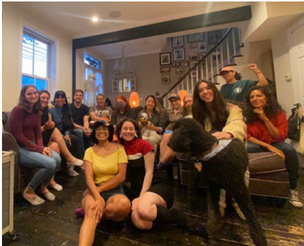
Photo of 4-H Staff and volunteers from various Youth Urban Farm Clubs.

We would not exist without the dedication of many community volunteers, volunteer Advisory Board, and community partners. Thank you so much to all our wonderful volunteers and partners for everything!