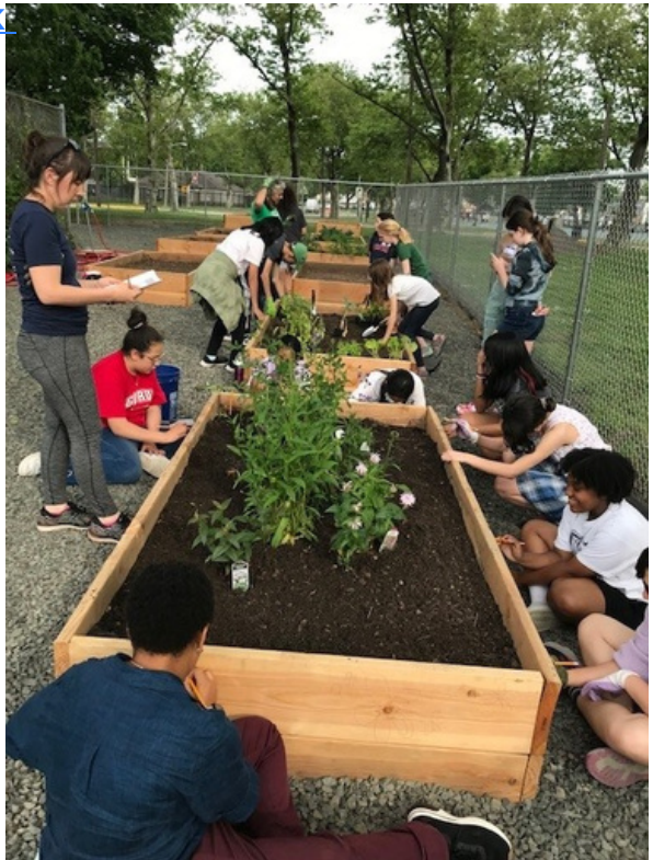
Photo of youth from the 4-H Youth Native Plant and Pollinator Club led by the folks of 4-H volunteers and the Native Plant Society Hudson County Chapter.

Garden open hours are Mondays (4-6 pm), Tuesdays (4 - 7 pm), and Saturdays (10 am - 1 pm). We are also planning a garden and nutrition garden series this summer and a possible second garden build at West Hudson Park in Kearny/Harrison!