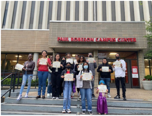
Photo of youth from 4-H Teen Council with their certificates.