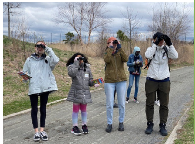
Photo of youth birding at Lincoln Park West with adult birders.