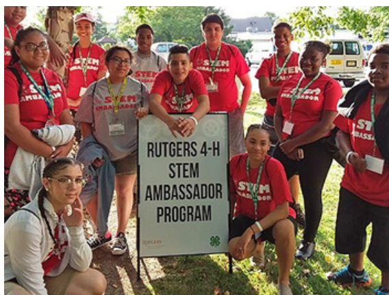
Photo of youth STEM Ambassadors.

After two years of virtual programming, we are excited to bring our 14th cohort of Rutgers 4-H STEM Ambassadors back to the New Brunswick campus. We will be welcoming about 60 current 7-9th graders from various counties in NJ with an interest in STEM who will explore various tracks in STEM, develop as a leader in their community, and prepare for college! We are looking forward to a great summer orientation and kickoff for our new recruits! Applications will open again in the 2023. For more information on this program, please visit https://nj4h.rutgers.edu/join-stem-ambassadors/