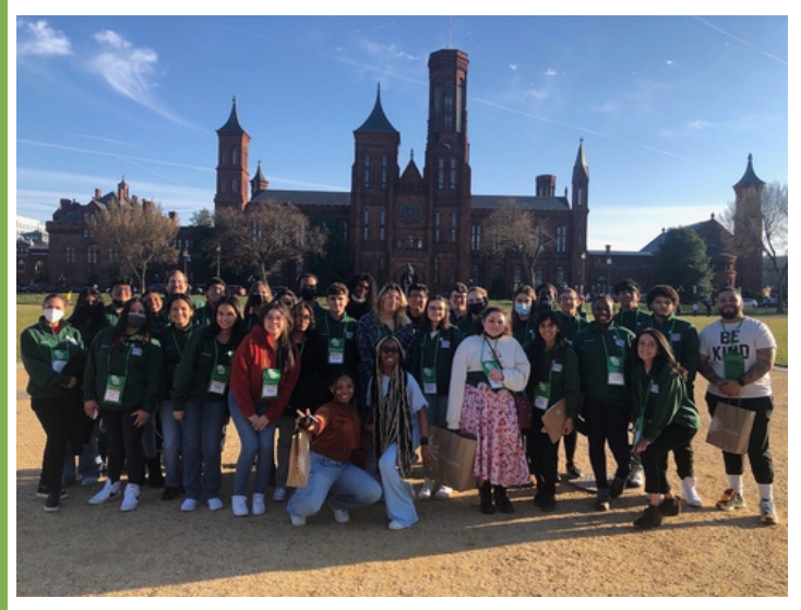
Photo from Summit: our 28 youth delegates with their chaperones in the National Mall

This winter, 28 NJ 4-H youth delegates traveled to the Washington DC metro area for the National 4-H Youth Agri-Science Summit to develop skills and knowledge to address issues in agriculture. food security, and sustainability. The Summit was an engaging learning and networking opportunity for the youth delegates from various regions of the state, including four youth from Hudson County. This experience highlighted the many ways that agriculture and food systems is relevant in their lives and how it impacts their communities. In addition to hearing keynote speakers, attending workshops, and meeting youth from across the country, the youth delegates created a community action plan focused on pollinator habitats to engage their peers and communities.