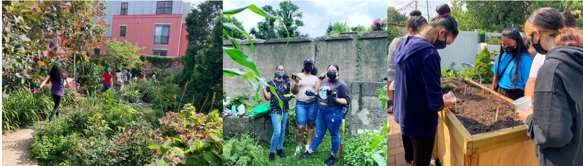
Photos from left: Youth at Sgt. Anthony Park and Garden; youth after harvesting at Harsimus Cemetery; youth planting their raised beds at Guttenberg Arts

Youth Urban Farm Club offers youth the opportunity to make a difference in their community by learning about gardening while building leadership and teamwork skills. This summer, 30 youth participated in the program across 4 sites, each with its own unique focus. Urban Quack focused on animal husbandry; Guttenberg Arts on gardening, art, exploring heritage crops, and food justice lessons; Sgt. Anthony Park and Garden on caring for native and perennial plant gardens with some community service activities at a local food pantry; and Harsimus focused on vegetable and herb production.